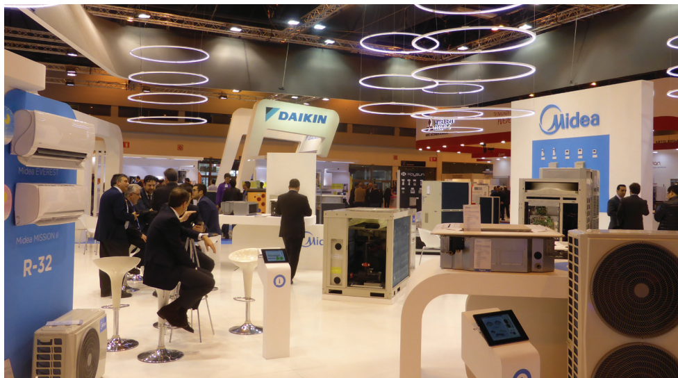
Daikin and Midea were among a strong contingent of multi-national exhibitors at the Climatización & Refrigeración trade fair.